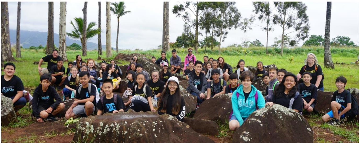
We are grateful for the time spent with our nā ’ōpio who live and are educated within the 36,000 acres of Pu’uhonua Kūkaniloko, kalana lihu’e , wahiawā , halemano . You are our Hawaiian National Treasures. We are honored to have shared our mo’olelo .