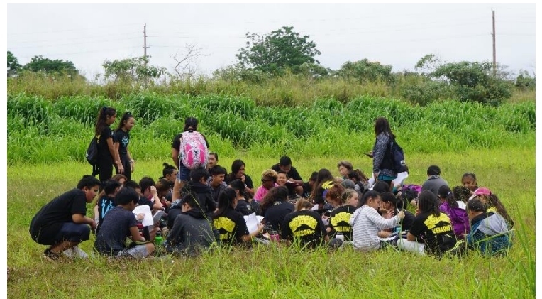
Haumāna brought their workbooks to answer questions regarding the Science, Technology, Engineering and Mathematics – STEM. They gathered and wrote while answers were fresh on their minds.