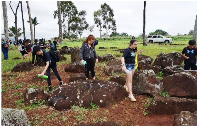
Students shared water with our nā pōhaku and lau kī .