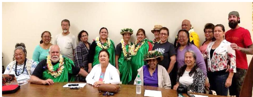
Hawaiian Civic Club of Wahiawā nā lālā 'ōiwi a me nā lālā ho'okama in attendance April 11, 2k18...